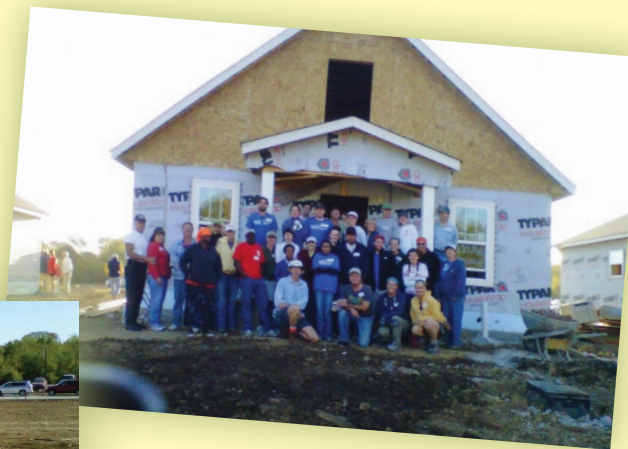
The Urban Sun staff worked hard and had some fun building this Habitat for Humanity home.

For more information, call Urban Sun at (615) 291-6800.